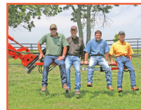
850 lbs of weight is no match for the LimbSaw's solid-steel frame

For unsurpassed durability, the LimbSaw's extension arm is made from heavy-duty square tubing that is double-walled at the cutting end. While most chainsaw bars are laminated, the LimbSaw's chain bar is made from a single piece of hardened alloy steel , and is laser cut for precision. Kickback is not an issue with the LimbSaw because each saw is equipped with an aggressive chain that utilizes each and every tooth for maximum cutting power.